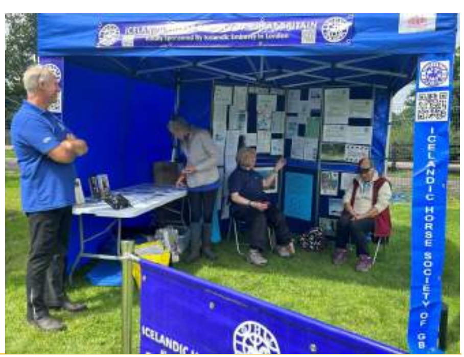
IHSGB Ltd. Annual Report 2023. Page 15

The next item on my rather long list was the IHSGB logoed clothing. Tylers Equestrian Embroidery were chosen be used to as our supplier, they are а family run company but supply many large horse societies and groups. The IHSGB clothing has been enormous an success, at the BCs worn