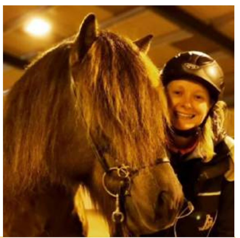
IHSGB Ltd. Annual Report 2023. Page 28

Education Trustee – September 2023 education@ihsqb.co.uk